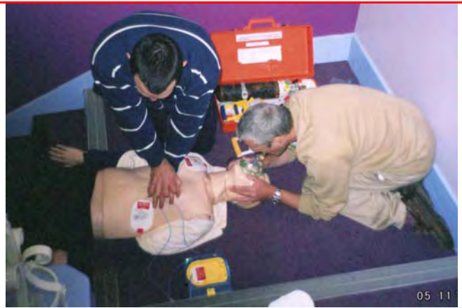
Oxygen therapy, defibrillation and good old-fashioned chest compressions. This Annie has a good chance of survival....