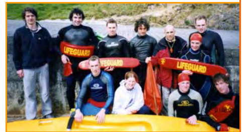
Successful beach lifeguard candidates in Co. Mayo,

These are mailed separately only to Approved Centre co-ordinators