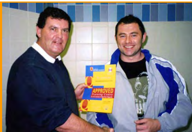
Representatives of Approved Training Centres receive their Registration Certificates