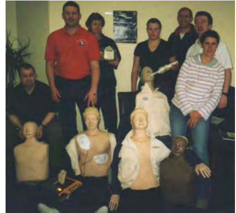
Candidates at the BLS-AED Trainer Course in Dublin

If your Club or Leisure Centre would like to organise defibrillation courses, free training is available, sponsored by RLSS UK. We can also provide the latest new Laerdal defibrillators