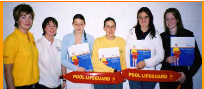
Successful Pool Lifeguards in Newry and Sligo