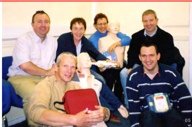
Successful course candidates at the BLS-AED Trainers re-validation course in Dublin on 6 November 2004

This 2-day course took place in Dublin during the Summer. The course included training and assessing of oxygen therapy, suction and of course defibrillation. Also run at the same time was a trainer re-validation. Candidates from as far away as Coleraine and Cork attended.