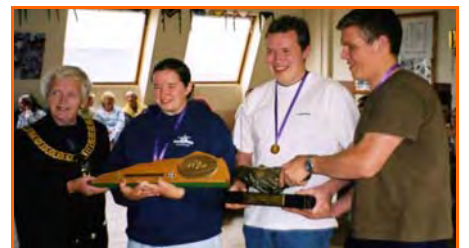
Winners of the Mountbatten Competition are presented with their trophy by the President of RLSS Ireland

We acknowledge the continued support for the Beach Lifeguard programme from Ambre Solaire